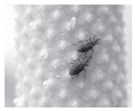
Fig. 4. Individuals of C. carinata with packages of pollen on the rostrum, legs, and elytra. Some emerged anthers are visible.

Even smaller numbers of C. laticola have been collected on A. consobrinum at La Selva (average: 2.6 \pm 2.0 individuals per inflorescence, range: 0-6 individuals, N=10), during both the pistillate and the staminate phase of anthesis. All other observations are congruent with those presented above. Additional information on