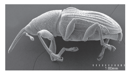
Fig. 2. Habitus of male of Cyclanthura carinata , lateral view.

predominantly detritivorous larvae that do not attack the infructescences or seeds of their host plants. Systenotelus Anderson and Gómez is an exception to this pattern (Anderson and Gómez 1997, Franz 2004, Franz and Valente 2005).