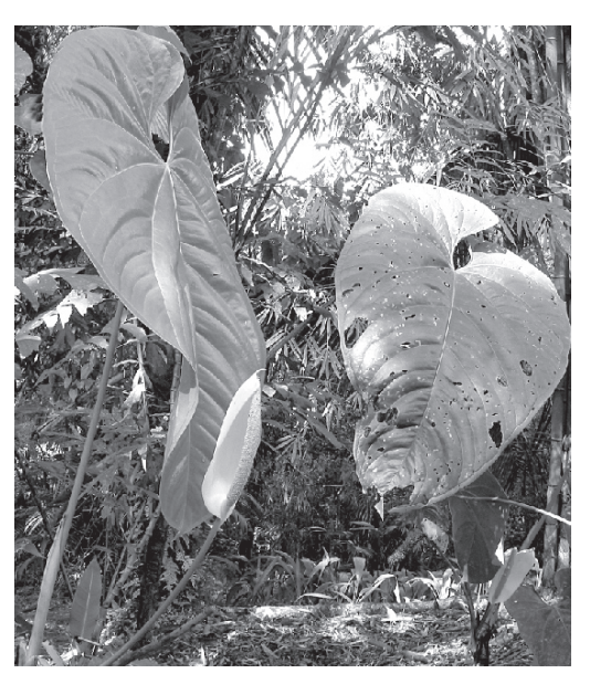
Fig. 3. Habitus of Anthurium formosum at Las Cruces, with flowering spadix and white covering spathe. The incforescences must be approached with extreme caution because any Cyclanthura weevils present tend to let themselves fall to the ground when perturbed and will not return for hours. To an uninitiated observer an inflorescence might well appear unoccupied, although there are 1-3 individuals present near the apex or base of the spadix, where they are covered in part by the spathe.

Anthesis of inflorescences: the anthesis of A. formosum (Fig. 3) has a duration of 8-15 days (Beath (1998). It initiates with a pistillate