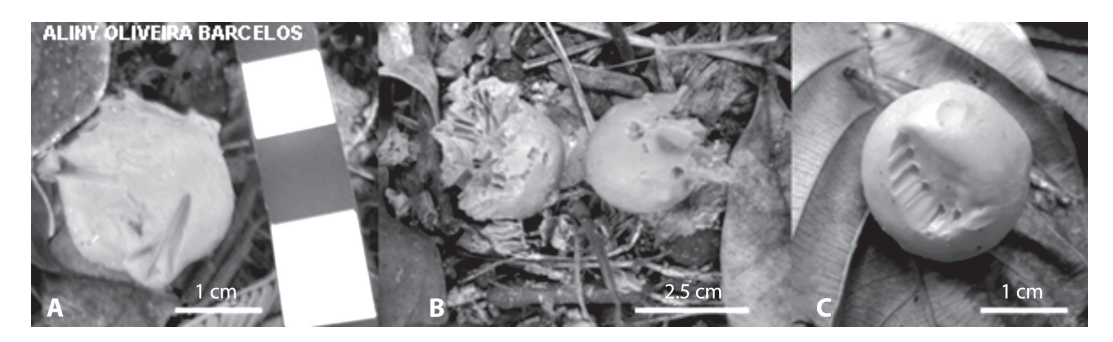
Fig. 2. Marks left by possible fruit predators: (A) Birds. (B) Mammals (rodents) and (C) Mammals.