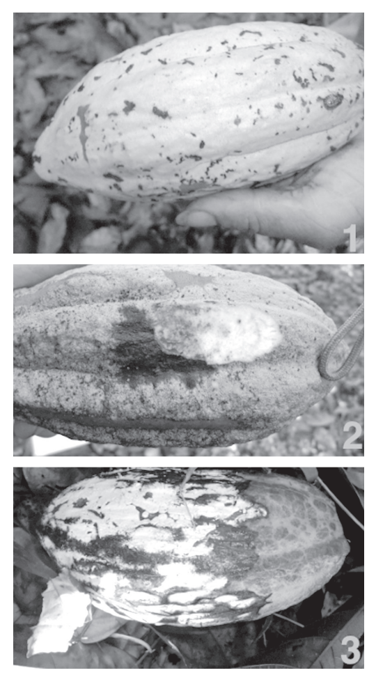
Fig. 1. Guide to monilia infection grades. Top to bottom: characteristic examples of infections of grades one, two, and three.

performed using Tukey "honestly significant difference" (HSD) tests with the "agricolae" package for R (De Mendiburu, 2013). Graphs were generated with the base R software package (R Development Core Team, 2012).