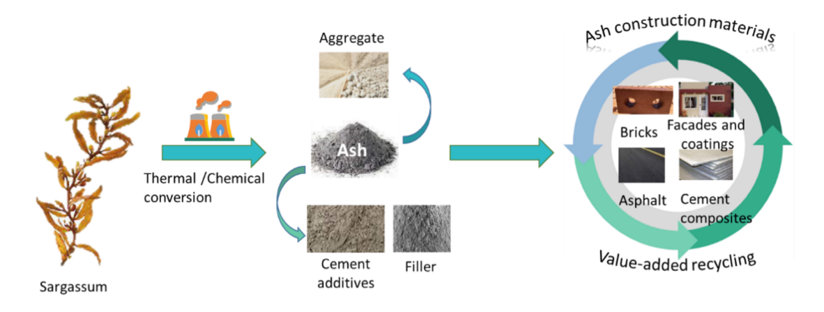
Figure 3. Upcycling of sargassum ash into construction materials.

Additionally, Posidonia Oceánica has been studied as reinforcement where rigidity and strength improved, ultimately enhancing the overall performance of the asphalt mix (Herráiz et al. 2016).