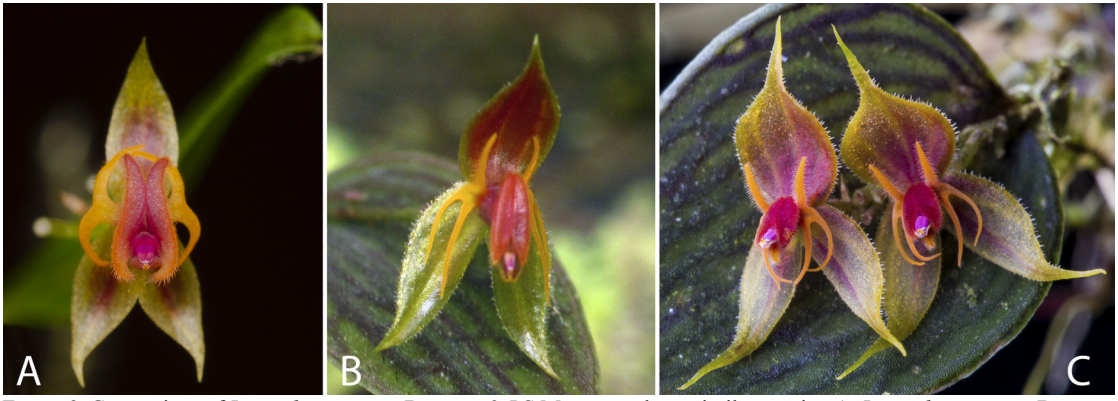
FIGURE 3. Comparison of Lepanthes tetrapus Baquero & J.S.Moreno and two similar species. A. Lepanthes tetrapus Baquero & J.S.Moreno. B. Lepanthes hexapus Luer & Escobar. C. Lepanthes aguirrei Luer.

towards the apex, transversely bilobed, filiform, 2.5 \times 0.5 mm, the lobes equal in size and shape, falcateoblong with the apex rounded, minutely pubescent, ciliate along the margins. Lip purple, orange towards the margin, bilaminate, the blades narrowly ovate to elliptic-oblong, the apex long pubescent, curved towards the column, 2.5–2.7 mm long, ciliate along the margins; the connectives cuneate, oblong, the body thick, densely pubescent, rounded, connate to the middle of the column; the appendix conspicuous, thick, pubescent, ovoid, bilobulate at the apex. Column cylindric, to 1.5 mm long, the anther and the stigma apical. Pollinia two, ovoid, basally filiform. Anther cap , magenta, obovate.