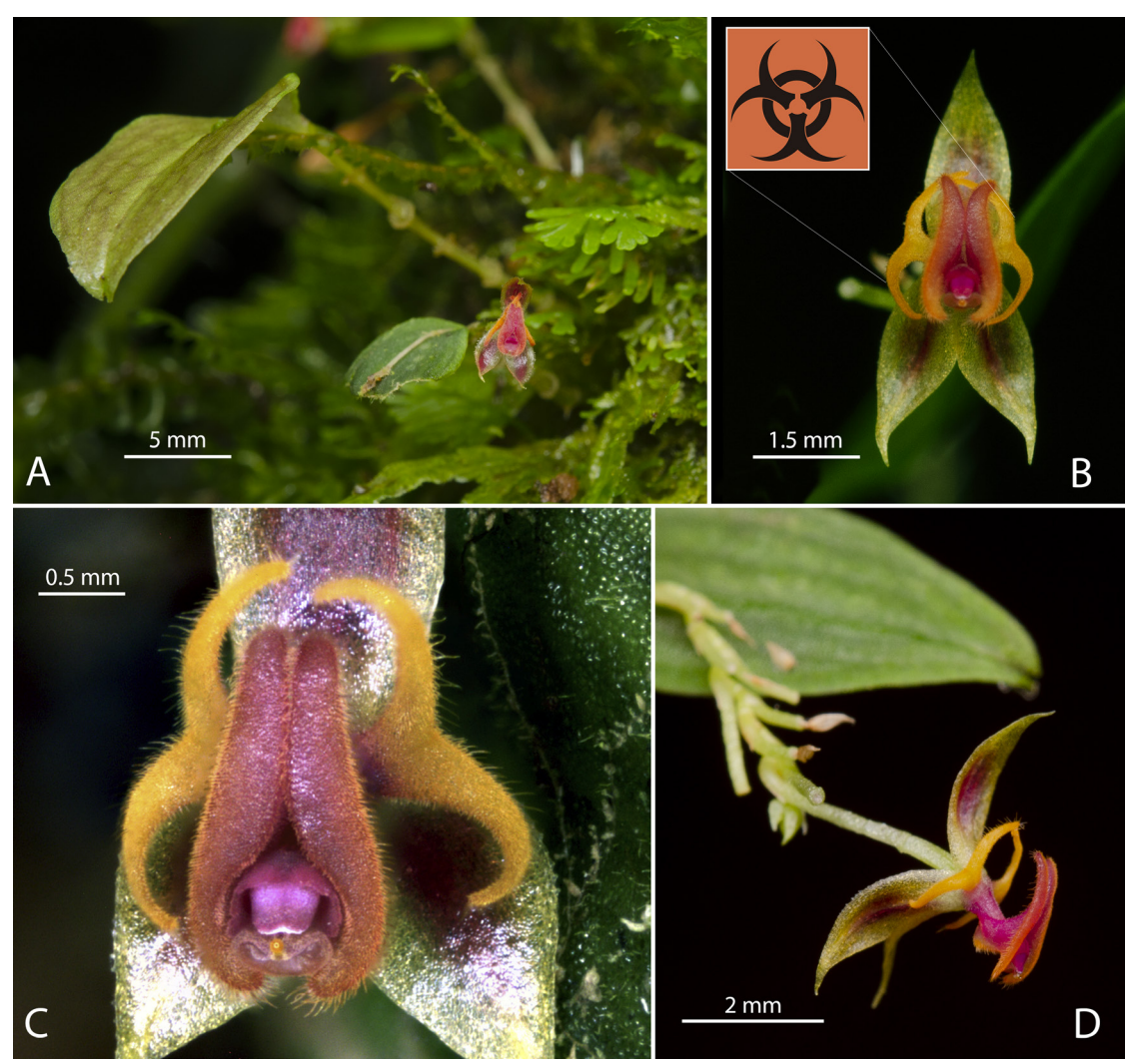
FIGURE 2. Lepanthes tetrapus Baquero & J.S.Moreno. A. Plant with flower in situ . B. Frontal view of the flower and comparison with biohazard international symbol. C. Close-up of the Lip and petals. D. Lateral view of the flower.

the petals with two curved, filiform lobes instead of three.