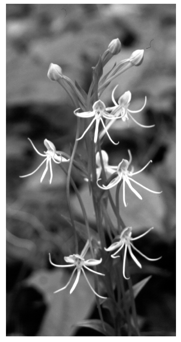
FIGURE 1. Habenaria macroceratitis inflorescence in habitat.

Four populations of H. macroceratitis were identified in west-central Florida representing various population sizes and conservation statuses. One of the populations was considered large (Hernando County #1, 270 plants) and existed on privately-owned land that was being adaptively managed for the orchidappropriate habitat. The second population was considered of moderate size (Hernando County #2, 65 plants) and existed on privately-owned land with no management being applied. The final two populations were considered small (Marion County, 16 plants; Sumter County, 10 plants), with the Marion County population existing on managed state-owned land and the Sumter County population existing on privately-owned non-managed land. Data concerning flowering versus vegetative production, plant demo-