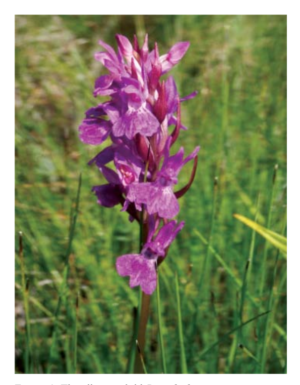
FIGURE 1. The allotetraploid Dactylorhiza traunsteineri at a natural site in Yorkshire, Britain.

ITS alleles, and in agreement with the patterns of morphology and ecological preference, D. majalis is more derived and genetically homogeneous, inferred to be the oldest of the three allotetraploids and to have passed through glacially induced bottlenecks in southern Eurasia. It has a fairly wide ecological tolerance of soil moisture and occurs at present in damp meadows and fens in western and central Europe, the Baltic region, and northern Russia. In contrast, D. traunsteineri is a more recently evolved set of allotetraploids that is more heterogeneous and still maintains both parental ITS alleles (Pillon et al., 2007). It probably originated post-glacially and at present shows a more localized and disjunct distribution in northwestern and central Europe (i.e., Britain, Scandinavia, and the Alps). It has narrow tolerances of both soil moisture and pH and grows in calcareous fens and marshes. A third allotetraploid, D. ebudensis, is a narrow endemic (at present forming a single population) in northwestern Scotland and may be as young as or younger than D. traunsteineri. The coastal dune habitat occupied