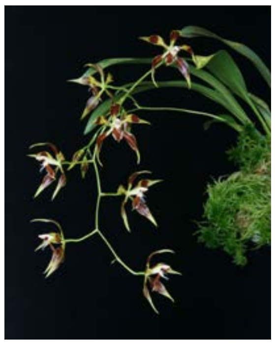
FIGURE 3. Odontoglossum filamentosum, plant habit (G. Deburghgraeve 282).

LANKESTERIANA 13(3), January 2014. © Universidad de Costa Rica, 2014.