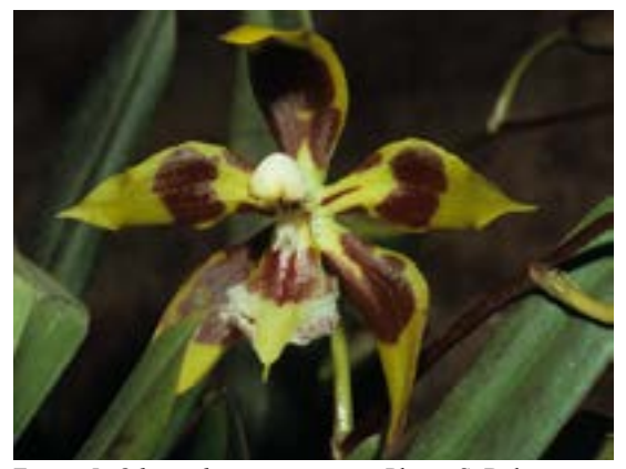
FIGURE 5. Odontoglossum juninense.