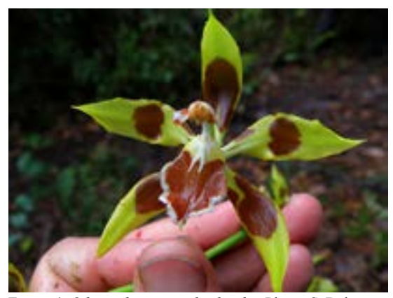
FIGURE 4. Odontoglossum epidendroides.

flowered in cultivation in Palca, Peru, by Manuel Arias, Dec. 2002, S. Dalström 2765 (color transparency in Dalström Archives).