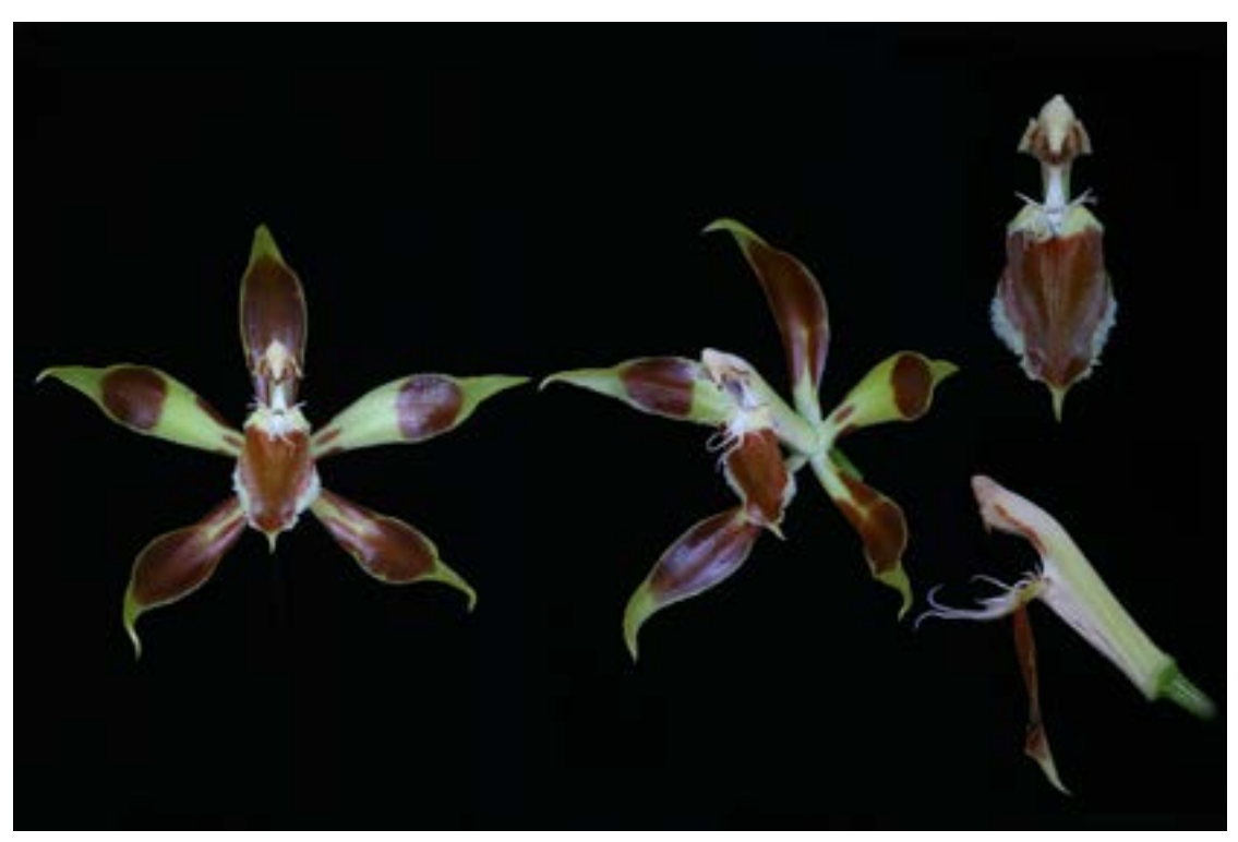
FIGURE 2. Odontoglossum filamentosum, floral diagram (G. Deburghgraeve 282).