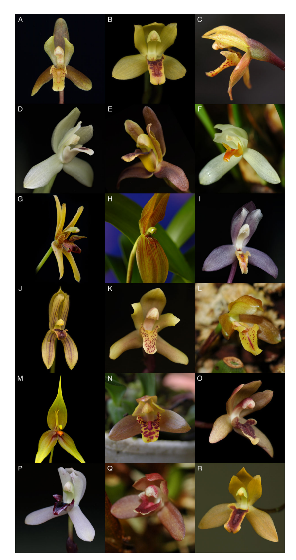
FIGURE 1. A. Mormolyca acutifolia; B. M. aureoglobula; C. M. cf. chacoensis; D. M. culebrica; E. M. dressleriana; F. M. hedwigiae; G. M. peruviana; H. M. polyphylla; I. M. richii; J. M. ringens; K. M. rufescens; L. M. sanantonioensis; M. M. schweinfurthiana; N. M. suareziorum; O. M. tenuibulba; P. M. sp. nov. A; Q. M. sp. nov. B; R. M. sp. nov. C.

suspect that they may, in fact, be describing the same species. However, more material including the type material needs to be examined to make a conclusive decision regarding their taxonomy.