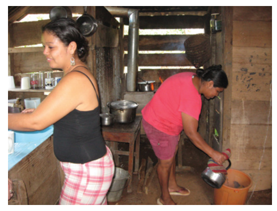
Mother and daughter work together in the kitchen

Speaking Bribri, they communicated minimally, but laughed and moved through their labor in choreographed steps preparing a meal for others to enjoy.