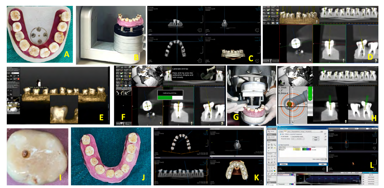
Figure 1 . A. Samples in Navident Jaw. B. Samples for optical scanner. C. Pre-op CBCT. D. Virtual Planning targeting MB canals. E. Tracing of landmarks. F. Calibration of bur. G. Simulation on Navident manikin. H. Bur orientation and drilling guided by target view. I. Access in individual tooth. J. Access cavities in all samples. K. Post-op CBCT. L. Tooth tissue loss assessment using OnDemand viewer softwar.