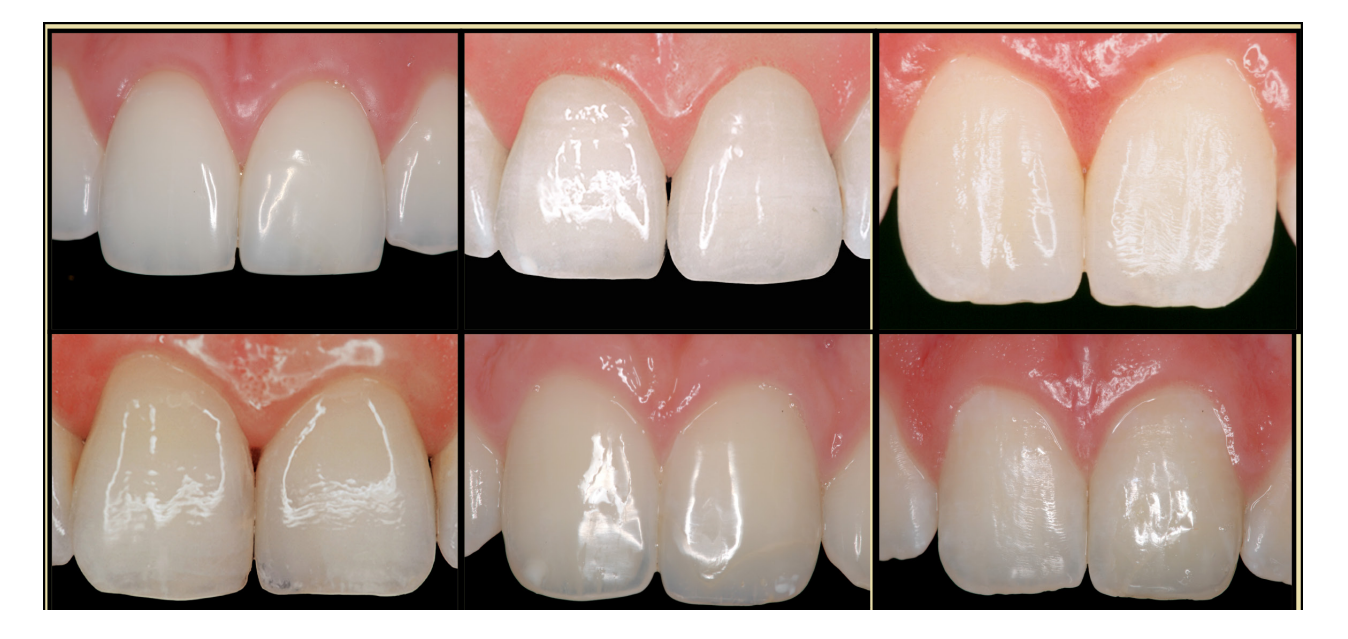
Figure 5. Representative images of Class IV Restorations (Group II – no preparation) categorized as Alfa Score after 4 years of clinical performance. No preparation of the cavosurface angle aims to preserve sound dental tissue based on a Minimally Invasive Dentistry approach.