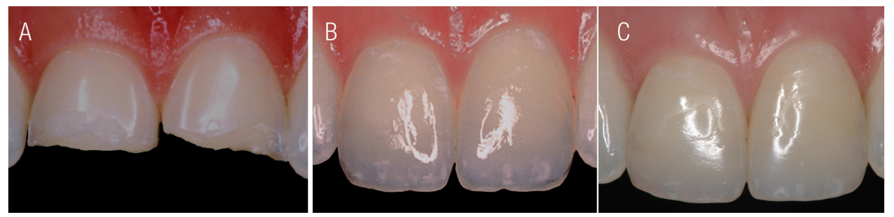
Figure 1. A. Initial frontal view of central upper incisors (Group I: with bevel preparation). B. After Direct Composite Restoration (7 Days evaluation). C. After 4 years of performance.

The evaluations were conducted based on Cvar & Ryge modified criteria (2005) of the United States of America Public Health Service (USPHS) system. The evaluations were recorded