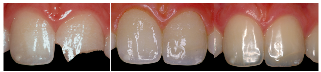
Figure 2. A. Initial frontal view of central upper incisors (Group II: no preparation). B. After Direct Composite Restoration (7 Days evaluation). C. After 4 years of performance.

in a previously prepared form and transferred to an Excel sheet (Microsoft®) for descriptive statistical analysis. The evaluation criteria and categories are shown in Table 1. As the initial evaluation, this phase was performed with the aid of dental mirror and explorer under good lighting condition and by the same previously calibrated examiners.