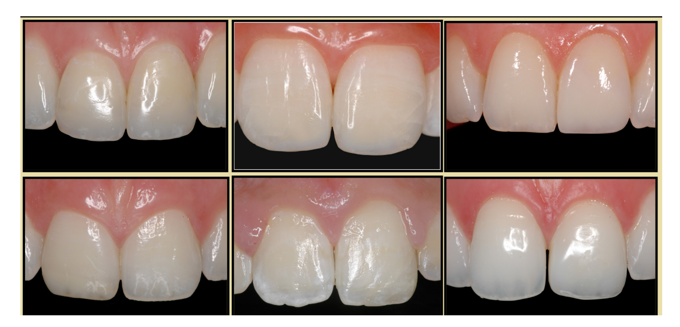
Figure 4. Representative images of Class IV Restorations (Group I – with) bevel preparation categorized as Alfa Score after 4 years of clinical performance.